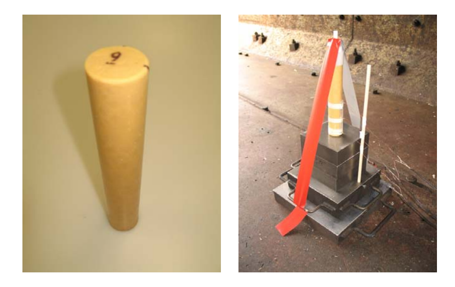
Figure 3: Left: cast cylinder of explosive for performance testing. Right: plate dent test coupled with velocity measurements.