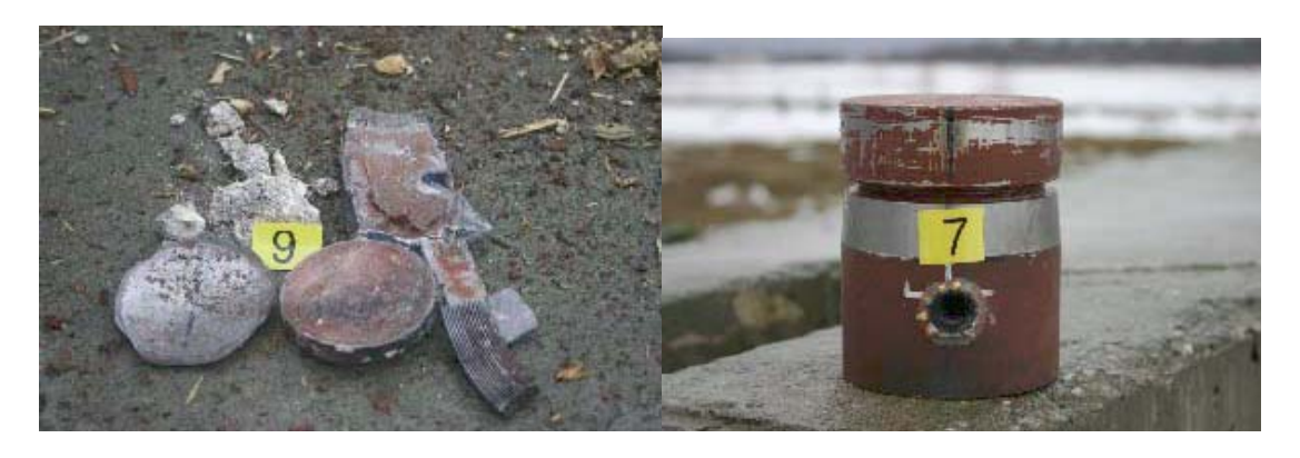
Figure 5: Bullet impact test results on HV-XRT 2. Left: violent reaction. Right: no reaction.