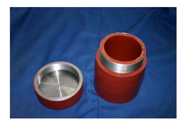
Figure 4: Test cylinder used in the bullet impact tests.

The results are presented in Table V. Even if it was clear that the formulations demonstrated a reduction in reaction violence, only one of them passed all three tests. The other two behaved in a GO - NO GO fashion, with either a violent reaction or no reaction at all. The reaction violence was difficult to evaluate since no pressure measurement was made. However, the fragments recuperated indicate a type II-III reaction (see Figure 5). In contrast, the formulation with 10% ETPE and 69.5% HMX showed all burning reactions. This demonstrated that the formulations had the potential to pass the bullet impact test in real items. The next step will be to modify slightly the formulations to improve their behaviour, and cast them in 105mm for testing later this spring.